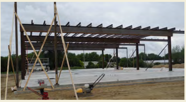
May 31, 2012