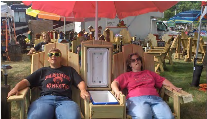
Plymouth County Fair