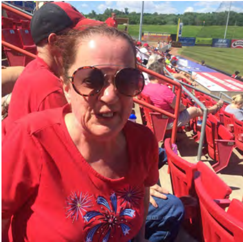
Sioux City Explorers Baseball Game