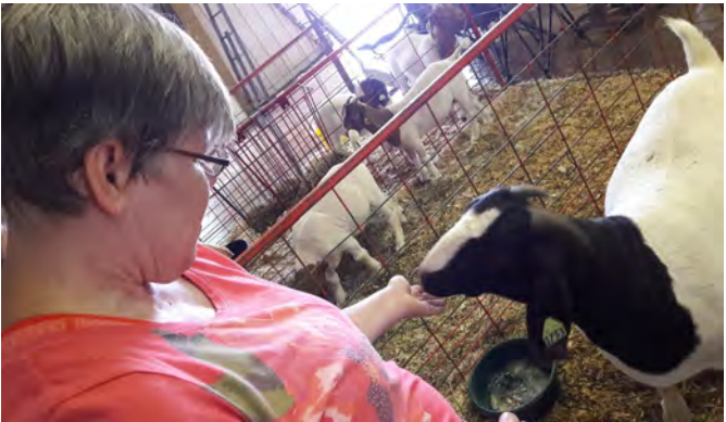
Sioux County Fair