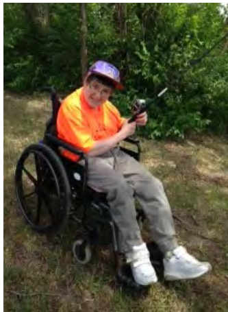
Fishing at Mill Creek Park