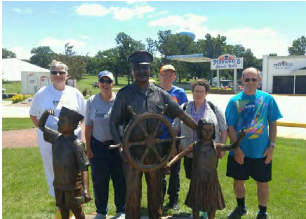
Northwest IA History Trip— Sheldon to Spirit Lake