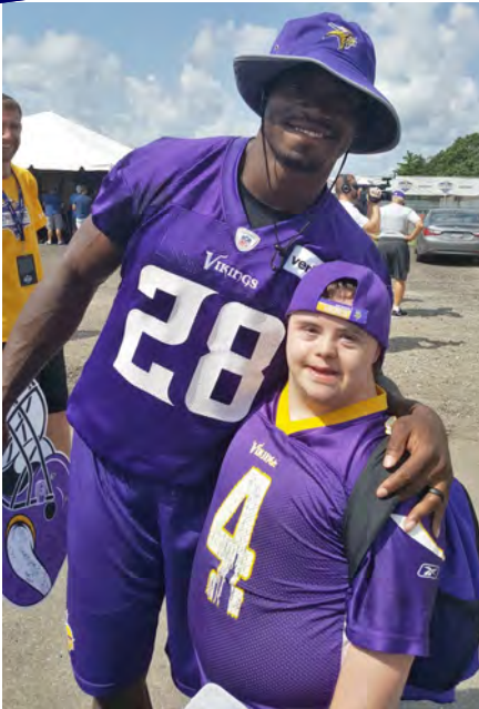
MN Vikings Training Camp