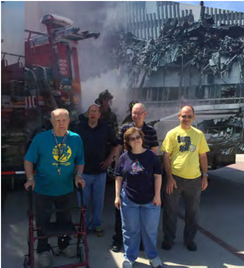
9/11 Memorial — Battery Park, Sioux City